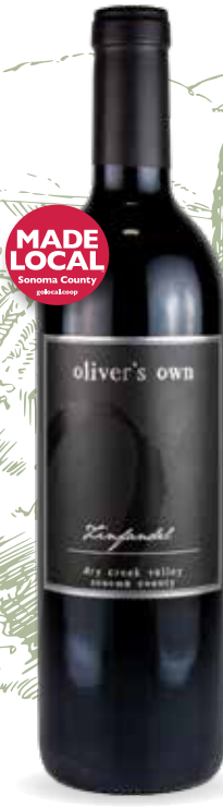
OLIVER'S OWN Zinfandel