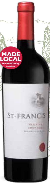
ST. FRANCIS Old Vine Zinfandel

We're celebrating the complex flavors of Zinfandel. The folks on our wine team have each selected their favorite to feature from a range of styles - try them each at special pricing all month long. Make sure to flip this over to discover more about Zinfandel including pairing notes and more!