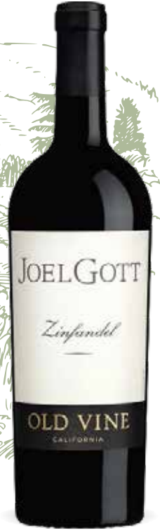
JOEL GOTT Old Vine Zinfandel