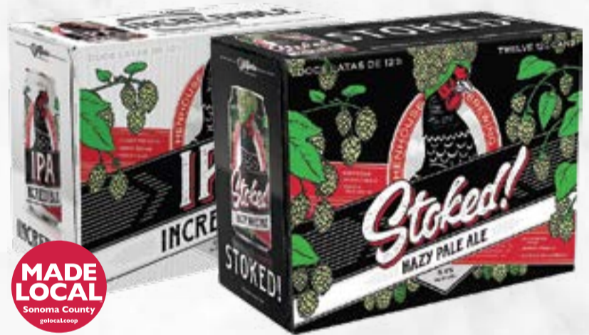
HENHOUSE INCREDIBLE OR STOKED! $17.99 +crv 12 Pack/12 oz. Cans.