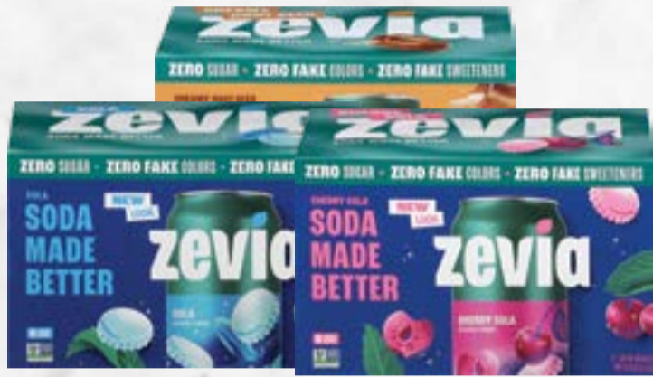
ZEVIA SODA $4.49 +crv Selected Varieties. 6 Pack/12 oz. Cans.

No pizza night would be complete without the perfect beverage to wash it down with. No matter what your choice is, it is sure to bring your whole meal together.