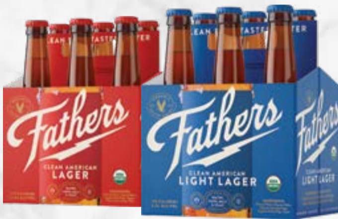
FATHERS ORGANIC LAGER OR LIGHT LAGER $10.99 +crv 6 Pack/12 oz. Bottles.