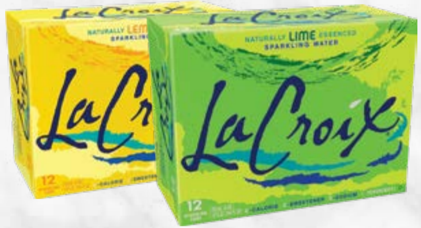
LACROIX SPARKLING WATER $4.49 +crv Selected Varieties. 12 Pack/12 oz. Cans.