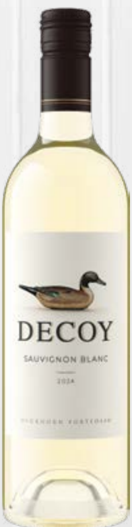
DECOY SAUVIGNON BLANC 2024, North Coast. 750 ml. Bottle