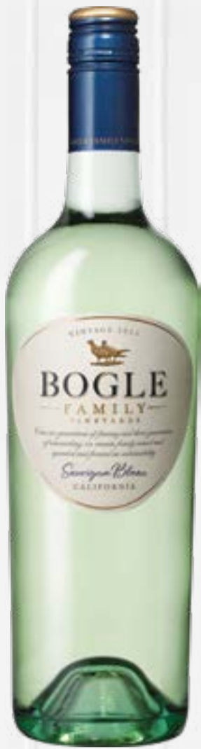
BOGLE SAUVIGNON BLANC 2024, California. 750 ml. Bottle