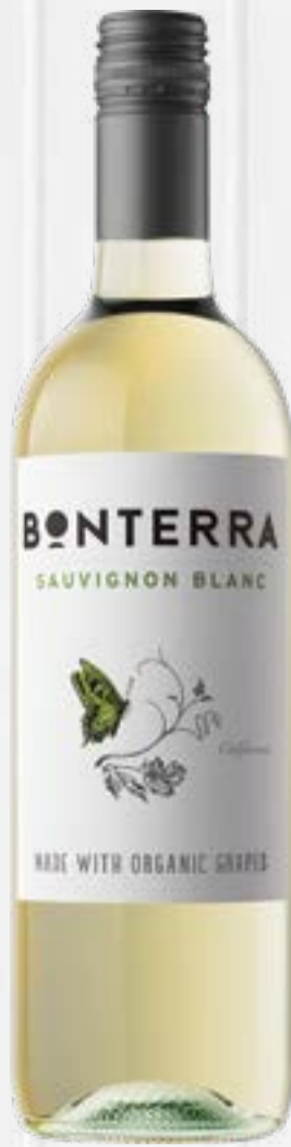
BONTERRA SAUVIGNON BLANC 2025, California. 750 ml. Bottle