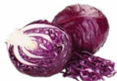
RED CABBAGE CRUNCHY LEAFY CABBAGE. MILD, SLIGHTLY SWEET. Nice addition to slaws, salads & braised dishes.