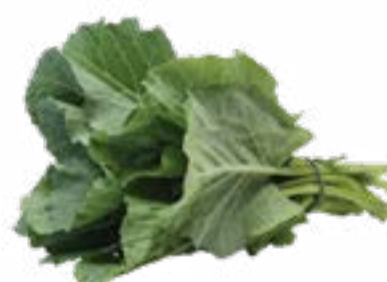
COLLARD GREENS LEAFY GREEN. EARTHY, SLIGHTLY BITTER. Delicious braised, sautéed & in southern dishes.