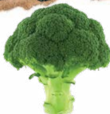
BROCCOLI CROWNS TENDER BROCCOLI TOPS. MILD, SLIGHTLY EARTHY. Excellent for steaming, roasting & stir fries.