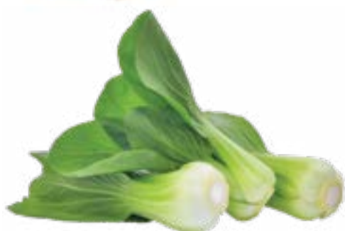
BABY BOK CHOY TENDER LEAFY GREEN. MILD, SLIGHTLY SWEET. Great for stir-fries, steaming & soups.