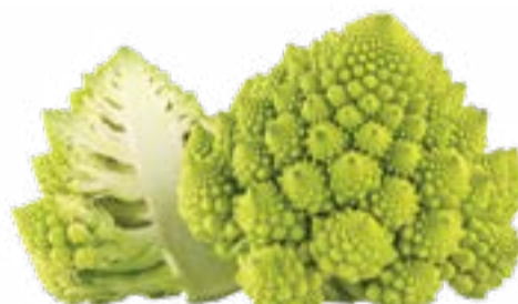
ROMANESCO FRACTAL GREEN BRASSICA. NUTTY, MILD. Great roasted, steamed or raw.