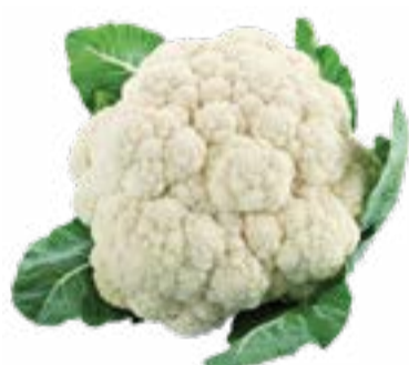
CAULIFLOWER DENSE WHITE FLORETS. MILD, SLIGHTLY NUTTY. Great for roasting, mashing & soups.