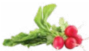
RED RADISH CRISP ROOT VEGETABLE. SHARP & PEPPERY. For salads, pickling, & garnishes.