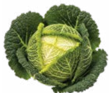
SAVOY CABBAGE CRINKLED LEAFY CABBAGE. MILD, SLIGHTLY SWEET. Use it in salads, soups & stuffed dishes.