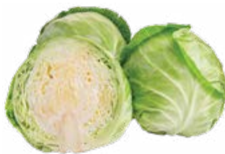
GREEN CABBAGE DARK LEAFY GREEN. MILD, SLIGHTLY SWEET. Try it in salads, soups & sautéed.