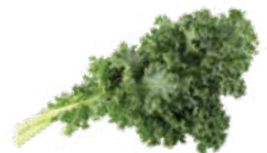
GREEN KALE CURLY LEAFY. SLIGHTLY BITTER, EARTHY. Use in salads, smoothies & sautéed dishes.