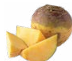
RUTABAGAS ROOT VEGETABLE. SWEET & EARTHY. Try it roasted, mashed or in a soup or stew.