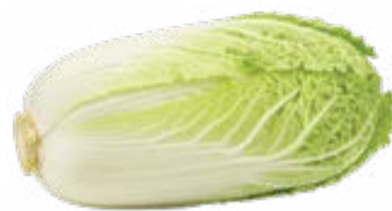
NAPA CABBAGE CRISP LEAFY CABBAGE. MILD, SLIGHTLY SWEET. Use it in salads, stir-fries & kimchi.