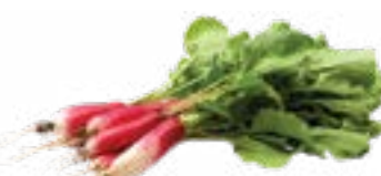
FRENCH BREAKFAST RADISH ELONGATED RADISH. MILD, SLIGHTLY PEPPERY. Use as a raw snack, salads or on buttered baguettes.