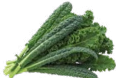
LACINATO KALE DARK LEAFY GREEN. MILD, SLIGHTLY SWEET. Try it in salads, soups & sautéed.