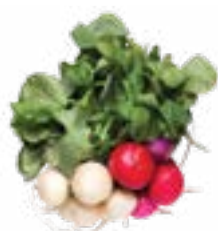
EASTER EGG RADISH SMALL COLORFUL RADISH. CRISP & PEPPERY. Tasty in salads, pickled or as a fresh garnish.