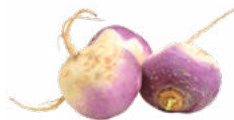
TURNIPS ROOT VEGETABLE. MILDLY SWEET & PEPPERY. Perfect roasted, mashed, or added to soups & stews.