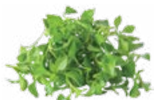
WATERCRESS PEPPERY LEAFY GREEN. CRISP & FRESH. A nice addition to salads, sandwiches, soups.