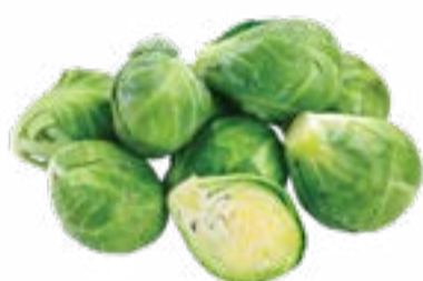
BRUSSELS SPROUTS MINI CABBAGE BUDS. NUTTY, SLIGHTLY BITTER. Tasty roasted, sautéed & in side dishes.