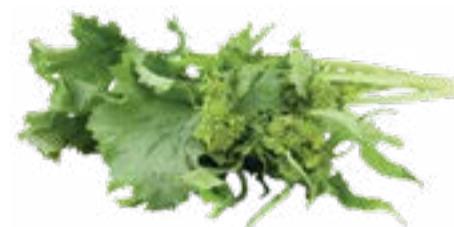
BROCCOLI RABE LEAFY GREEN. BITTER & PEPPERY. Perfect sautéed, in pasta dishes & italian cuisine.