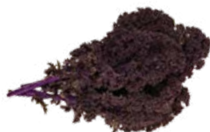
RED KALE RUFFLED LEAFY GREEN. EARTHY, SLIGHTLY SWEET. Lovely for salads, sautés & soups.