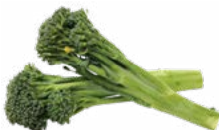
SWEET BABY BROCCOLI SLENDER BROCCOLI. MILD, SLIGHTLY SWEET. Use for roasting, sautéing & stir fries.