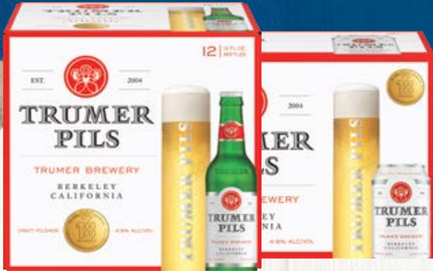
TRUMER PILS $14.99 +crv 12 Pack/12 oz. Bottles or Cans