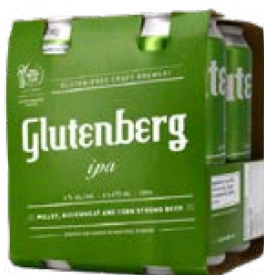
GLUTENBERG GLUTEN-FREE BEER Selected Varieties. 4 Pack/16 oz. Cans $10.99 +crv