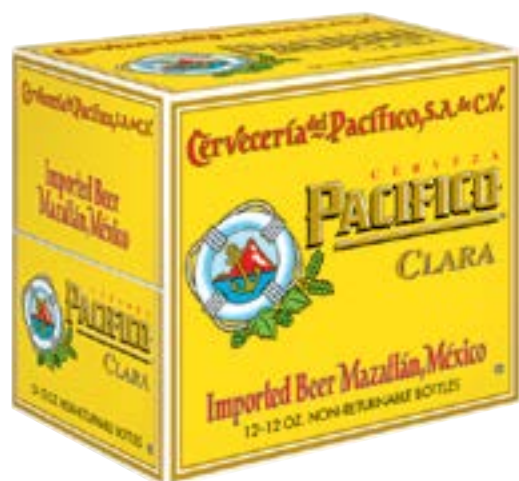
PACIFICO BEER 12 Pack/12 oz. Bottles or Cans $15.99 +crv