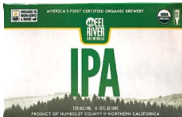
EEL RIVER BEER $10.99 +crv Selected Varieties. 6 Pack/12 oz. Cans