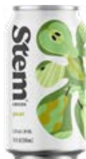
STEM CIDER Selected Varieties. 12 oz. Can $1.99 +crv