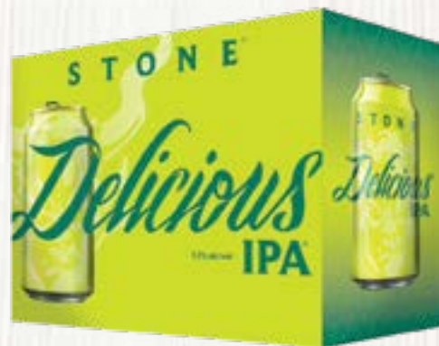
STONE DELICIOUS IPA $15.99 +crv 12 Pack/12 oz. Cans