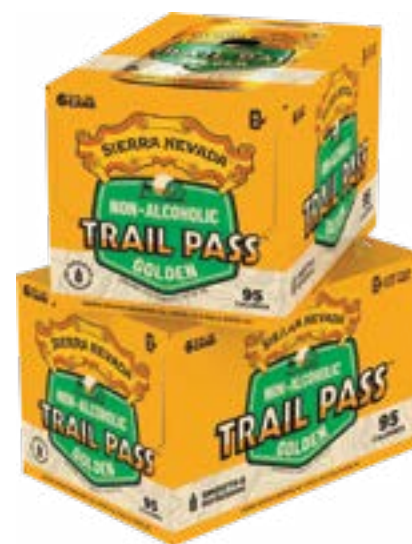
SIERRA NEVADA TRAIL PASS NON-ALCOHOLIC BEER Selected Varieties. 6 Pack/12 oz. Cans $9.99 +crv

These prices are good from May 22 through May 28, 2024 at Oliver's Market. Four locations to serve you in Sonoma County.