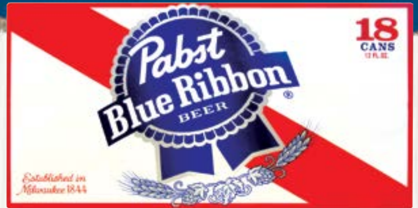
PABST BLUE RIBBON $11.99 +crv 18 Pack/12 oz. Cans