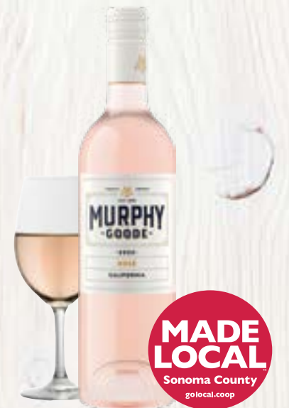
MURPHY GOODE ROSÉ $9.99 +crv 2022, California. 750 ml. Bottle

These prices are good from May 22 through May 28, 2024 at Oliver's Market. Four locations to serve you in Sonoma County.