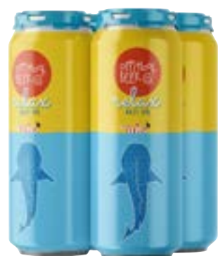
OFFSHOOT RELAX IPA 4 Pack/16 oz. Cans $10.99 +crv