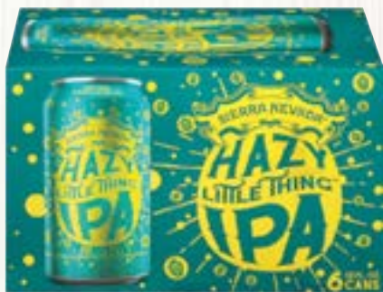
SIERRA NEVADA BREWING CO. $9.99 +crv Selected Varieties. 6 Pack/12 oz. Cans