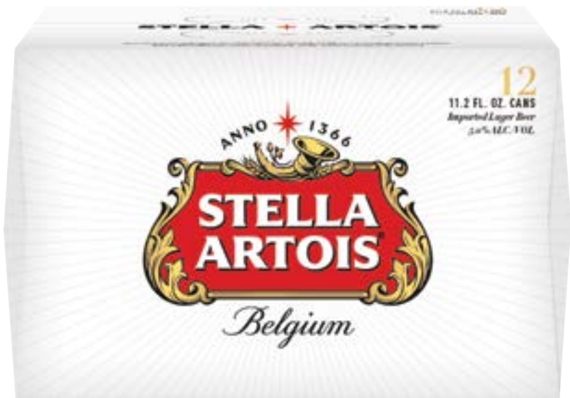
STELLA ARTOIS BEER $15.99 +crv 12 Pack/11.2 oz. Bottles or Cans