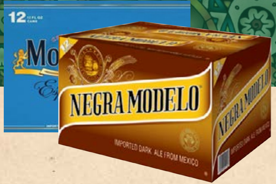
MODELO CERVEZAS $15.99 +crv Selected Varieties. 12 Pack/12 oz. Bottles or Cans