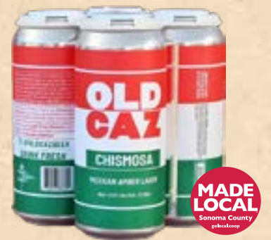
OLD CAZ CHISMOSA MEXICAN LAGER 4 Pack/16 oz. Cans $11.99 +crv