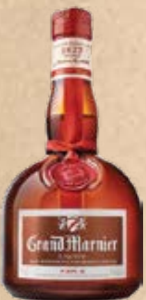
GRAND MARNIER LIQUEUR 375 ml. Bottle $19.99 +crv