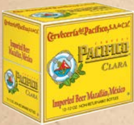
PACIFICO CERVEZAS 12 Pack/12 oz. Bottles $14.99 +crv