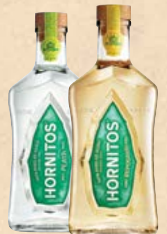
SAUZA HORNITOS TEQUILA Plata or Reposado. 750 ml. Bottle $19.99 +crv

These prices are good from May 1 through May 7, 2024 at Oliver's Market. Four locations to serve you in Sonoma County.