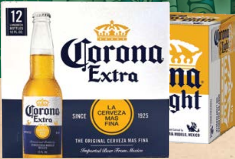
CORONA BEER $14.99 +crv Selected Varieties. 12 Pack/12 oz. Bottles or Cans