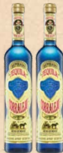
CORRALEJO REPOSADO TEQUILA 750 ml. Bottle $23.99 +crv