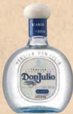
DON JULIO BLANCO TEQUILA 375 ml. Bottle $17.99 +crv