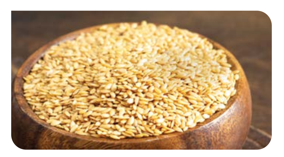
ORGANIC GOLDEN FLAX SEEDS $2.29/LB.