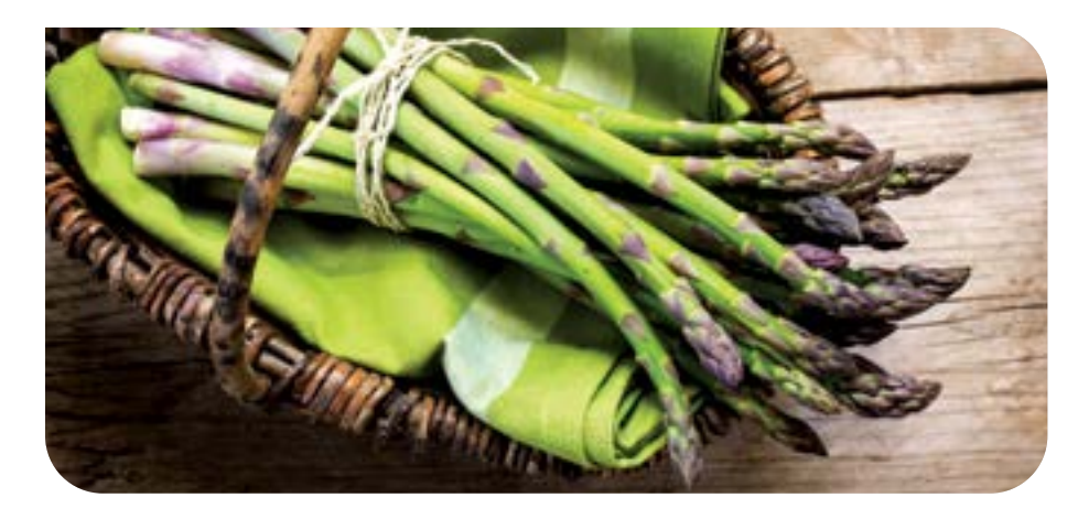
TALL SPEARS OF FRESH ASPARAGUS $1.49/lb.

Terrific shortcake toppers. Enjoy sliced on top of cereal for breakfast. Grown in California or Mexico. 1 Lb. Package.