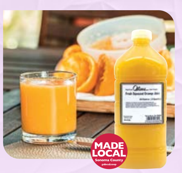
OLIVER'S OWN FRESH SQUEEZED ORANGE JUICE $11.99+crv