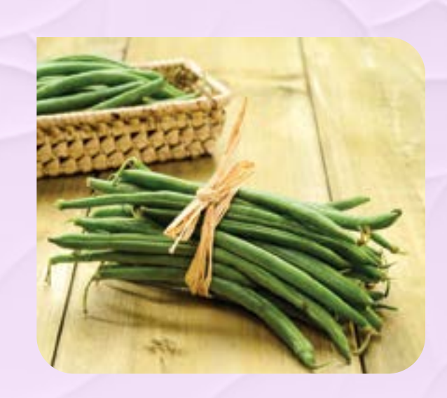
FRENCH CUT GREEN BEANS $4.99/EA.

Grown by Alpine Fresh in Mexico. 1 Lb. Package.