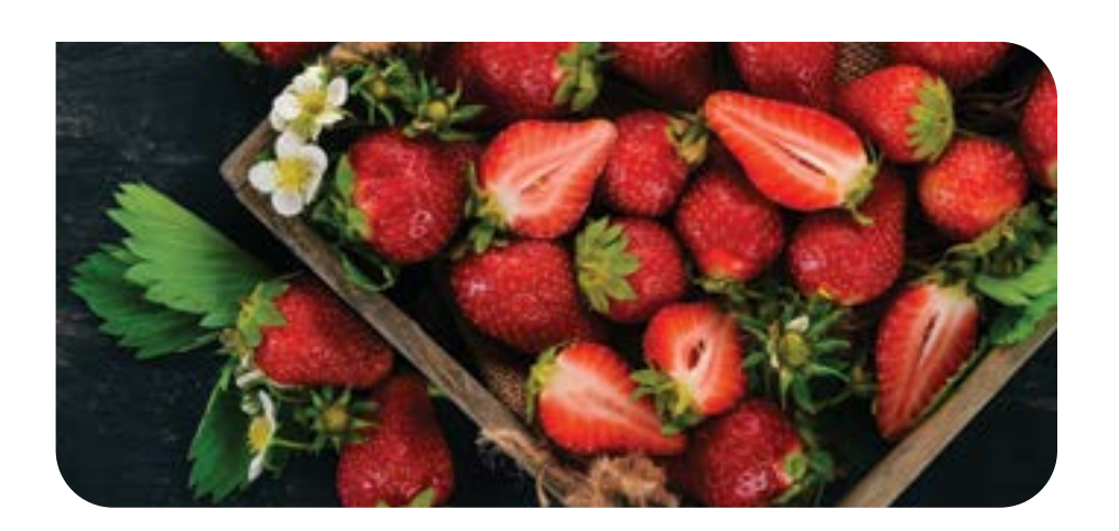
FRESH & SWEET STRAWBERRIES $2.49/PKG.

These peas are great for a side for your Easter Sunday table. California grown from Tutti Frutti in Lompoc.