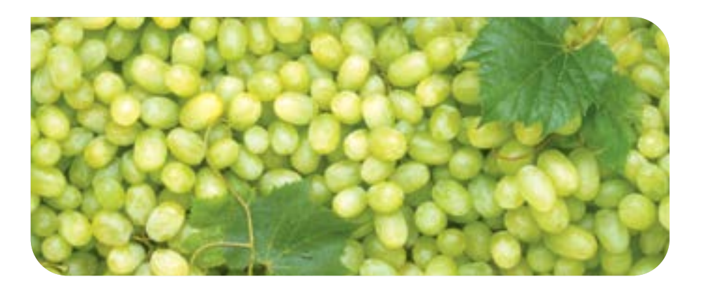
FRESH & CRISP GREEN SEEDLESS GRAPES $4.99/LB.

Wonderful for grating over a steak. Grown in Illinois.