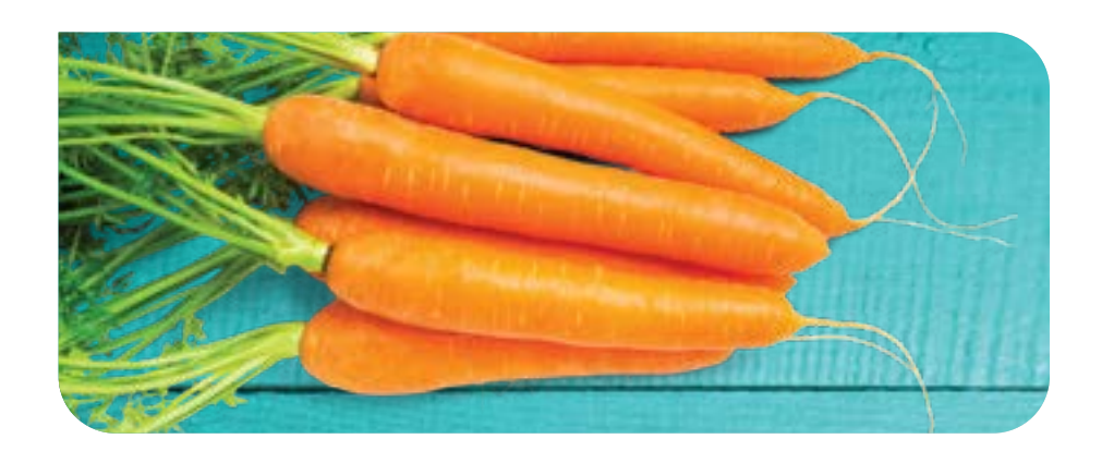
BABY BUNCH FRENCH CARROTS $1.49/EA.

These are beautiful apple-green colored spears with purpletinged tips. Grown in Caborca, Mexico.