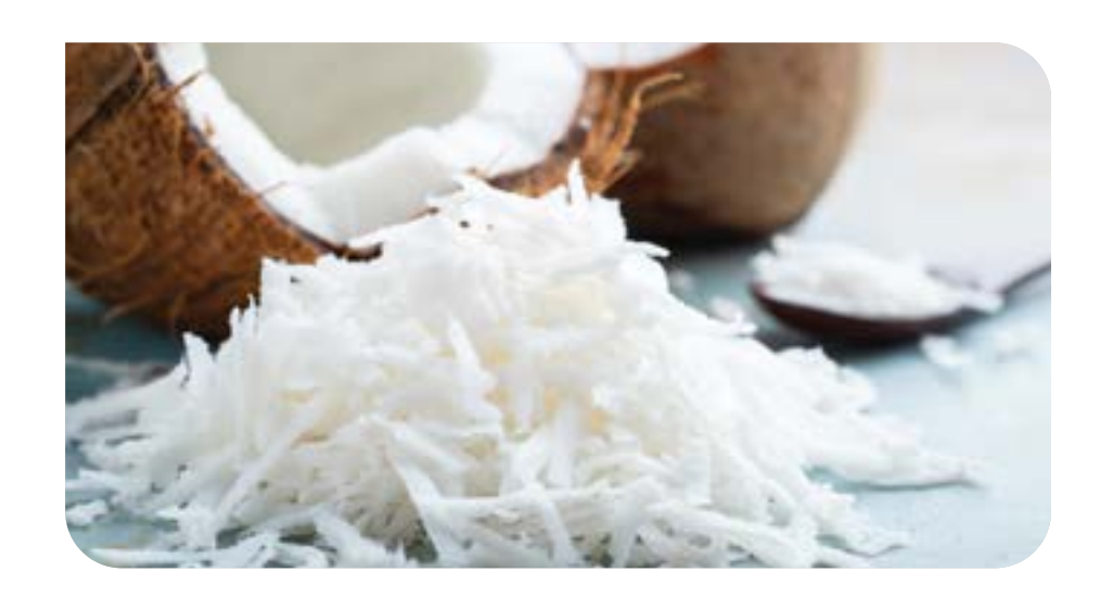
ORGANIC SHREDDED COCONUT $2.49/LB.