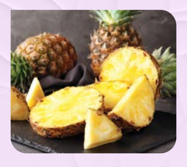
GOLDEN SELECT VARIETY PINEAPPLES $2.99/EA.