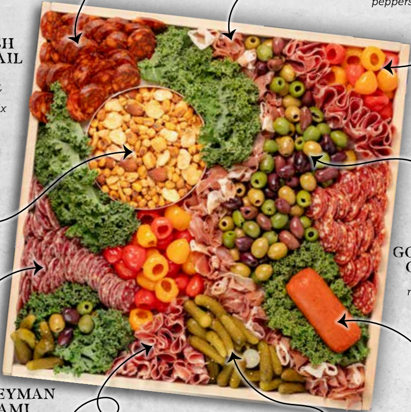
JOURNEYMAN NDUJA spicy, spreadable salami