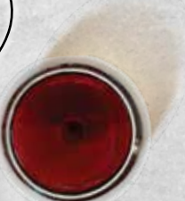
PARMIGIANO REGGIANO nutty, crystalline aged cheese